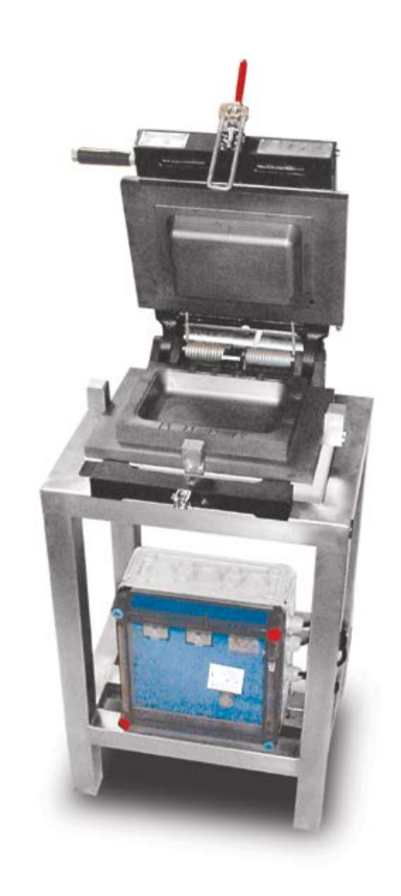
Special Designs Possible